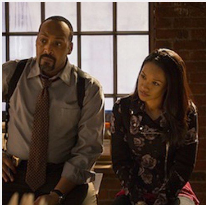
Veteran actor Jesse L. Martin (l) plays "Joe West" opposite Candice Patton (on r.) who is his TV daughter "Iris West" on CW network's "The Flash".

She added, "People want to see themselves on TV, especially comic book fans - they want to see their favorite characters well represented on TV and film." Patton is confident that the show with its diverse cast is part of that movement helping to move in the right direction, especially in the superhero genre.