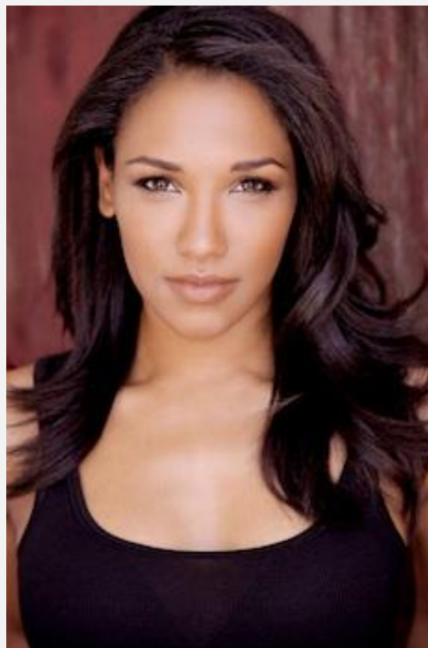
Actress Candice Patton's career is moving at light-speed as the leading lady on the CW's "The Flash".

"This business is so tough, and you work so hard for so long," she said. "You think things aren't going to work for you - and then one day you go in for 'The Flash' and they say: Yes! We want you!" Though seriously, the stunning Patton needs only flash her smile, serve up her quick wit, and all hearts are a flutter. Her dedication to her craft as an actor has set her successfully on her path, and Patton sees herself a very character-driven performer. So who provided the template for her character on "The Flash"?