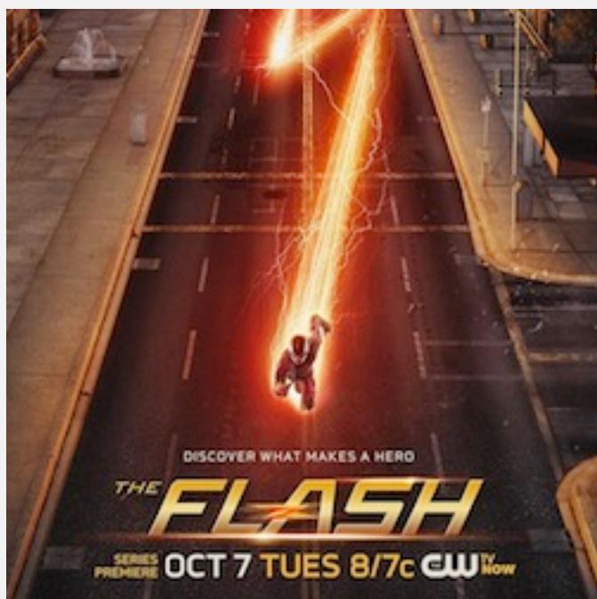
"The Flash" is among one of the most anticipated shows of the fall based on the DC Comics character.